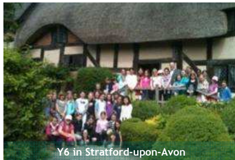
Y6 in Stratford-upon-Avon