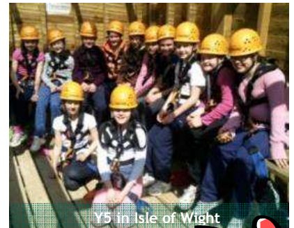
Y5 in Isle of Wight