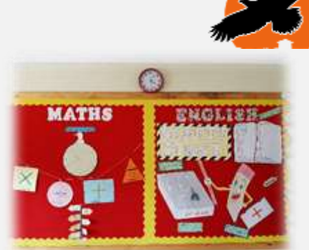
Creative and engaging display boards encouraging pupils to read and apply new ideas

This term some new pupils have been welcomed into Grade 5 and made to feel very much part of the class family. They have enjoyed learning about safety and demonstrated some of their knowledge when our nsaka roof caught fire. A neighbour was burning in their field and the wind carried the fire to Kapumpe. Mr Muleya and the Grade 5's were a big help in dousing the roof with water so that only a small section of the roof was in need of repair. As well as learning the academic subjects Grade 5 have been enjoying retelling Bible stories, taking care of their own vegetable patch and reading a variety of books together.