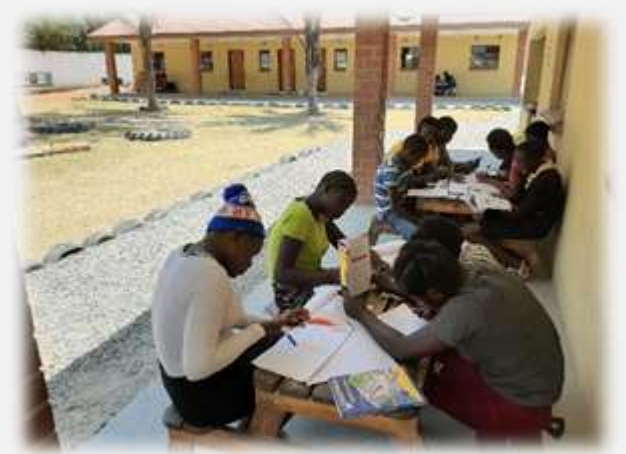
Excited to see more than half of our Grade 8-9 pupils coming to study

Our older pupils have really enjoyed being able to come to Saturday Study where there is a safe, clean, quiet place to study. It also helps to have the text books and many friends to discuss questions with. Aside from some pupil grades going up we have begun to notice improved attendance at school. It is wonderful to hear the children eager to learn and improve academically. Sadly they still do not receive much support from their teachers but they are not giving up and are willing to persevere.