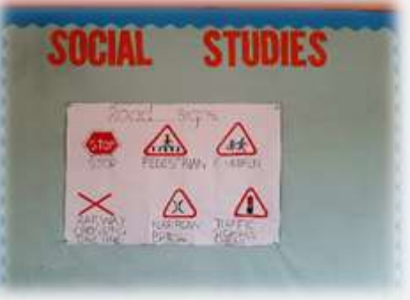
Ready to learn about road safety

'The Newsroom' has been our recent topic in Grade 2 and the pupils have really enjoyed thinking about what is going on in the world. We have been focusing on the local community of Kaniki but also thinking about other places at times. It is very hard for many of these 6-7 year olds to imagine other places as some of them have never been outside this area. Despite not having much first-hand knowledge of different places and sights, their memory is incredible! After teaching them new words, pictures, places, the pupils are avidly wanting to demonstrate what they have learned over the following days and weeks.