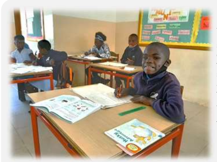
Pupils enjoy using books for reading and writing

They will soar on wings like eagles. Isaiah 40:31