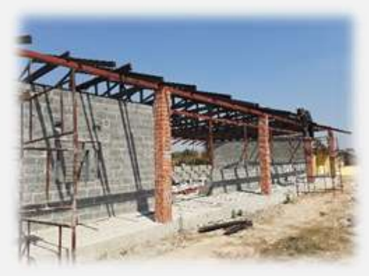
Arise block roof in place in the dry season

be an exciting couple of months seeing the Arise block looking like a finished building, ready for paint and furniture. By the end of 2021 we expect the Arise block to be ready for action.