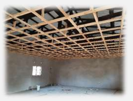
Arise block ceilings in place