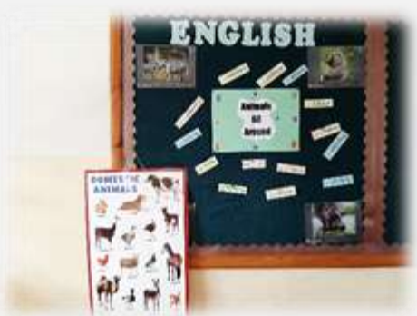
Helping pupils describe animals as well as name them