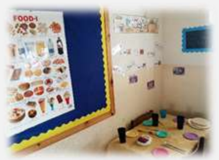
The café role play corner for this topic