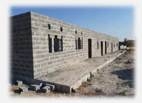
Arise block walls completed.