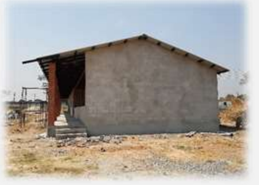
Arise block plastered, ready for painting

During the next term we will see the doors fitted, electrics connected and the floors completed with tiles and terrazzo. It will