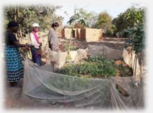
Alice showing us her protected vegetable patch

Extension, a guardian called Alice began to tell us that food was a problem at home but followed that by saying she was so grateful the water pump in the community had been fixed