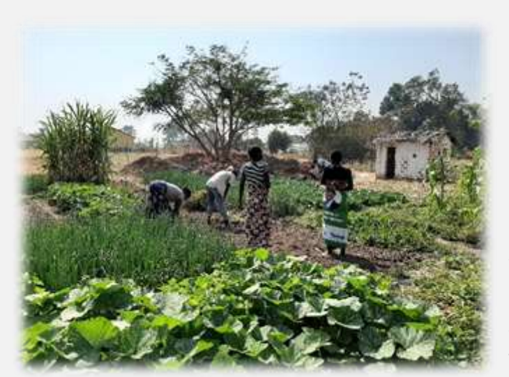
Guardians come to do planting, weeding, watering and harvesting every Friday morning