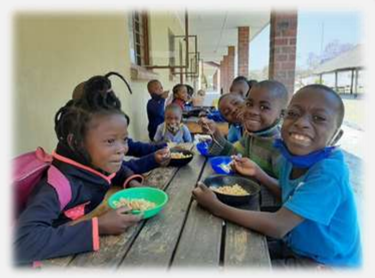
Break time food is a highlight of the school day

Having asked many pupils about what they would like to improve on now they are back at school, most have said their reading. Through the use of books in lessons at all ages, they are becoming aware that being able to read is central to learning and becoming independent. It's wonderful to hear the children so excited to read and develop their skills.