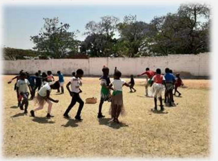
Learning how to perform traditional dance

Following the closure of schools in June for nearly 3 months, we have embarked on a busy and focused 17 weeks of school to cover the remaining term 2